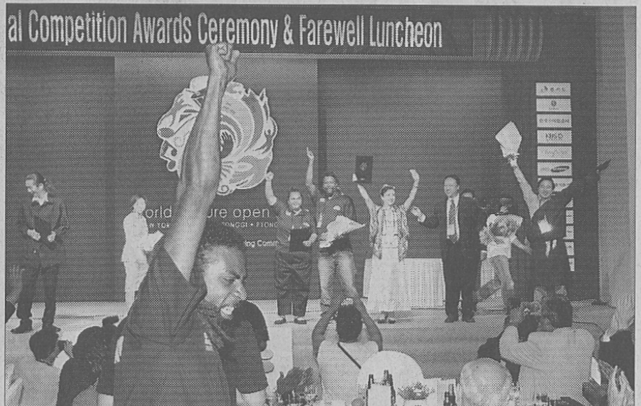
The World Culture Open 2004 closed yesterday in Ilsan, Gyeonggi province. Thirty-two of 163 teams won awards.

The event, which was planned as the first in a series to be held every two years, began last Wednesday in